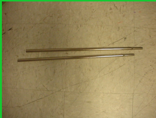
2 single poles (rain fly)