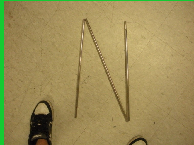
1 pole that is 3 poles long (back bone)